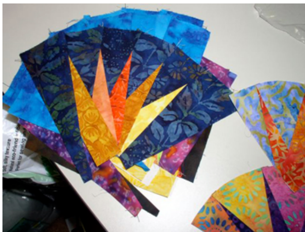
One of the blocks that will be part of our 2010 raffle quilt.

Don't forget that our July and August meetings will be held at Consumer's Power Building!