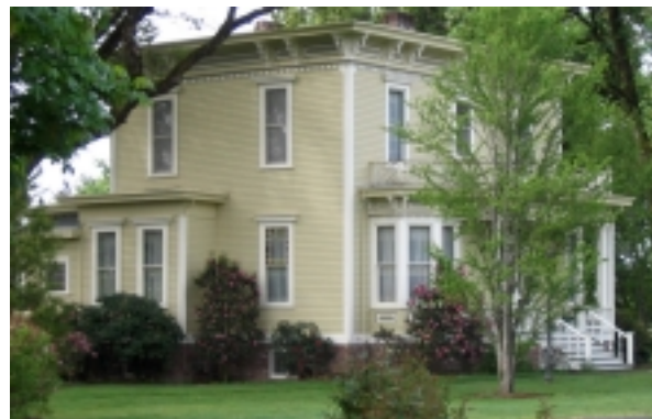
Sale garden on NE Pilkington Avenue